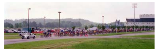
2003 Celebration of Life Ride