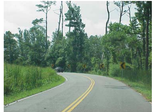
Muddy Creek Rd Scenic Byway