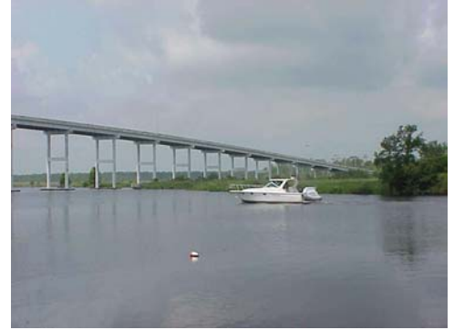
Pungo Ferry Bridge

There is substantial interest and desire from local bicycling associations to sponsor national bicycling events. The Tom Coghill Celebration of Life Ride, sponsored by the Tidewater Bicycling Association, has been held annually in June for the past three years. Each year has seen an increase in participants with approximately 750 bicyclists attending this year's event. The designation and development of this on-road route could prompt numerous other bicycling events to be held in the City expanding Virginia Beach's reputation as a tourist destination point.